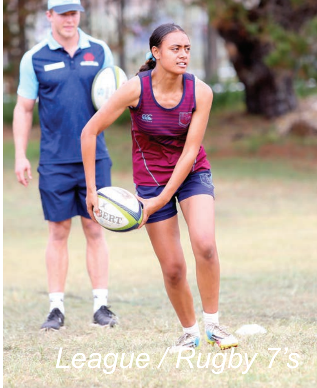
League / Rugby 7's