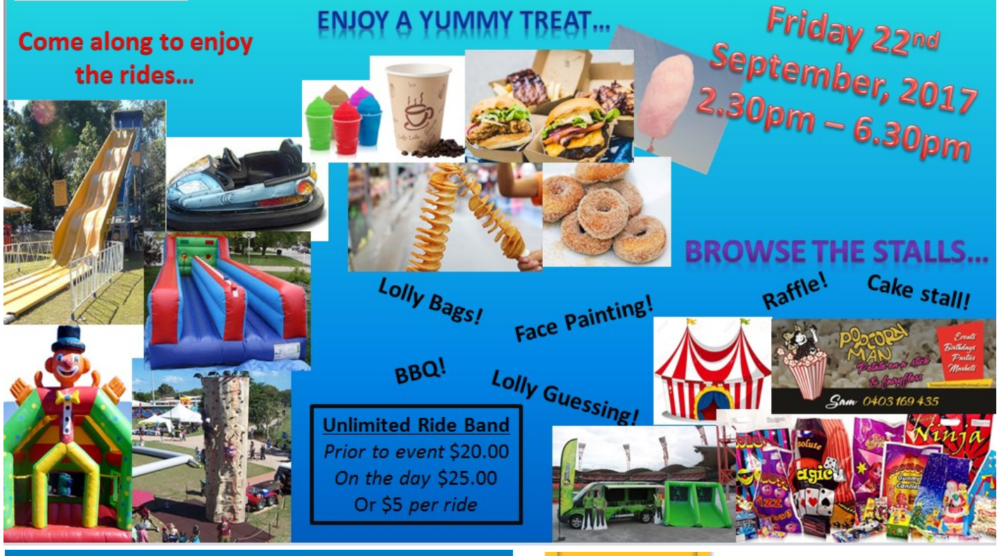
ENJOY & YUMMY TREAT ... _