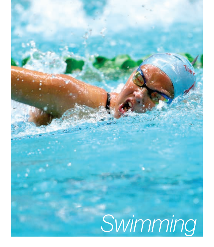
Boys & Girls: Year 7-12