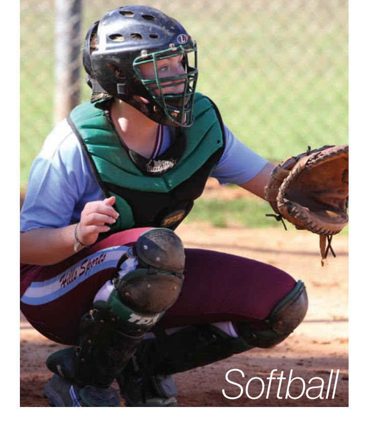
Boys & Girls: Year 7-12